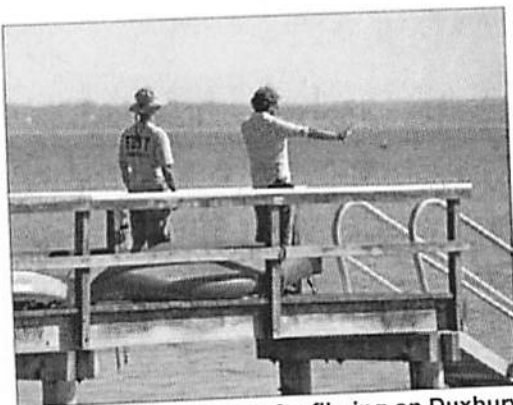
Crew members prepare for filming on Duxbury Bay.